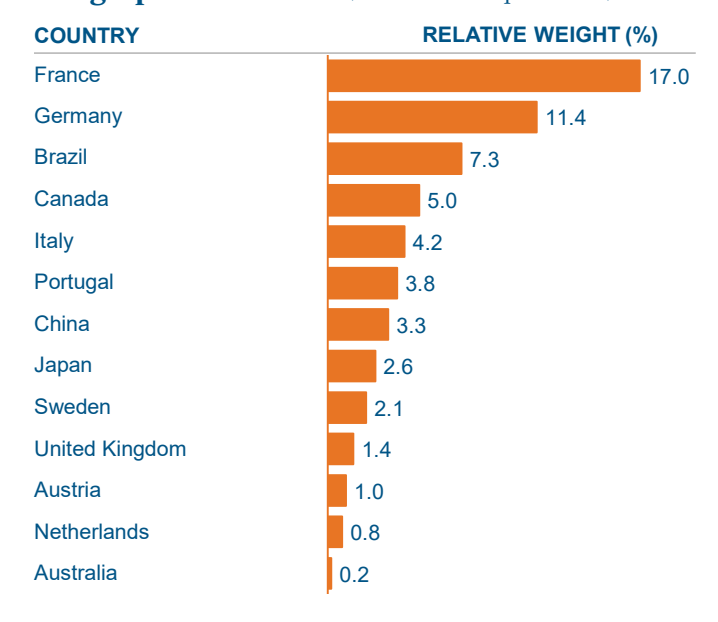
Geographic allocation (Ex. Cash & Equivalents)